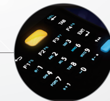
LED backlight keypad